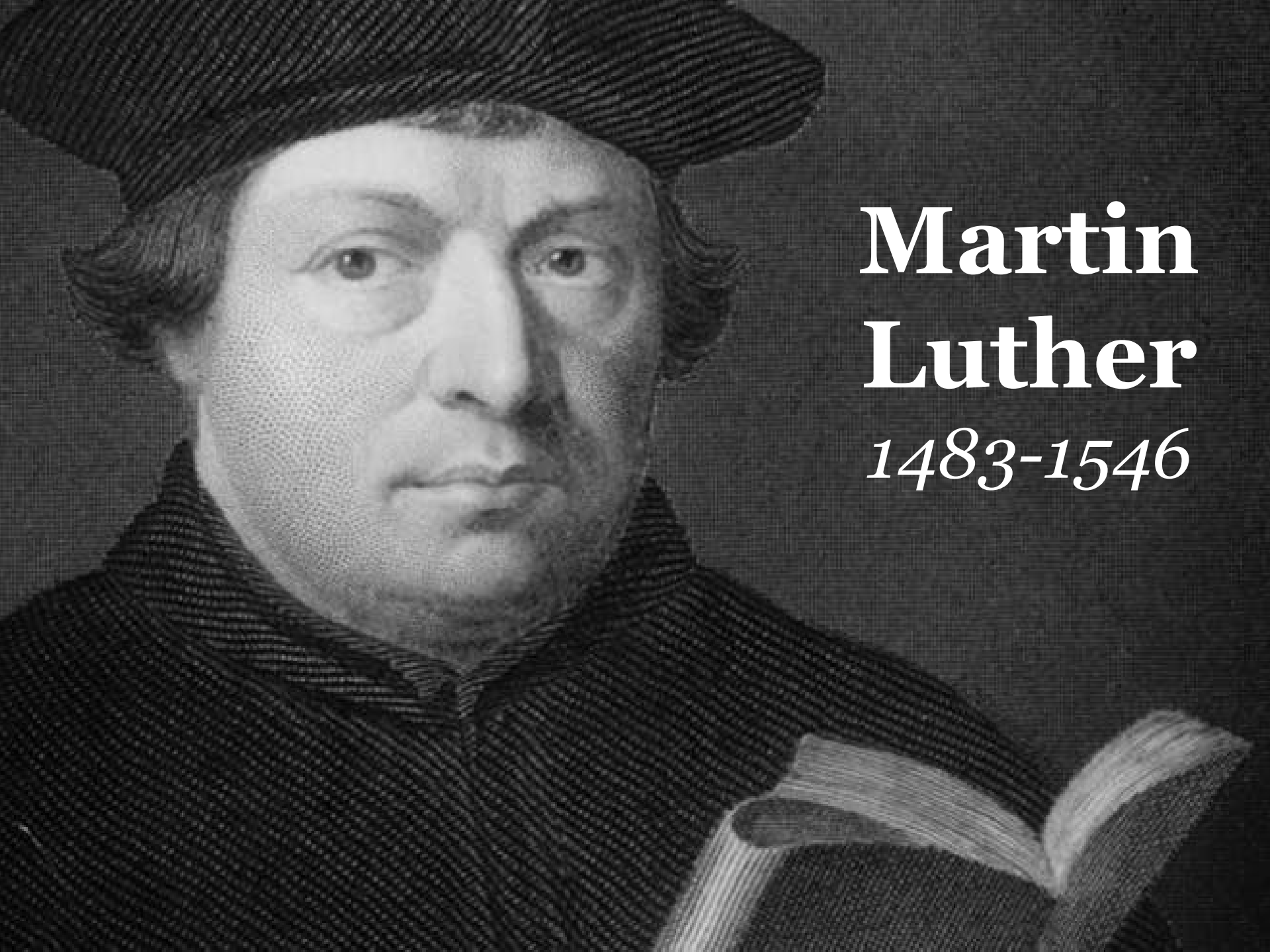
Martin Luther 1483-1546