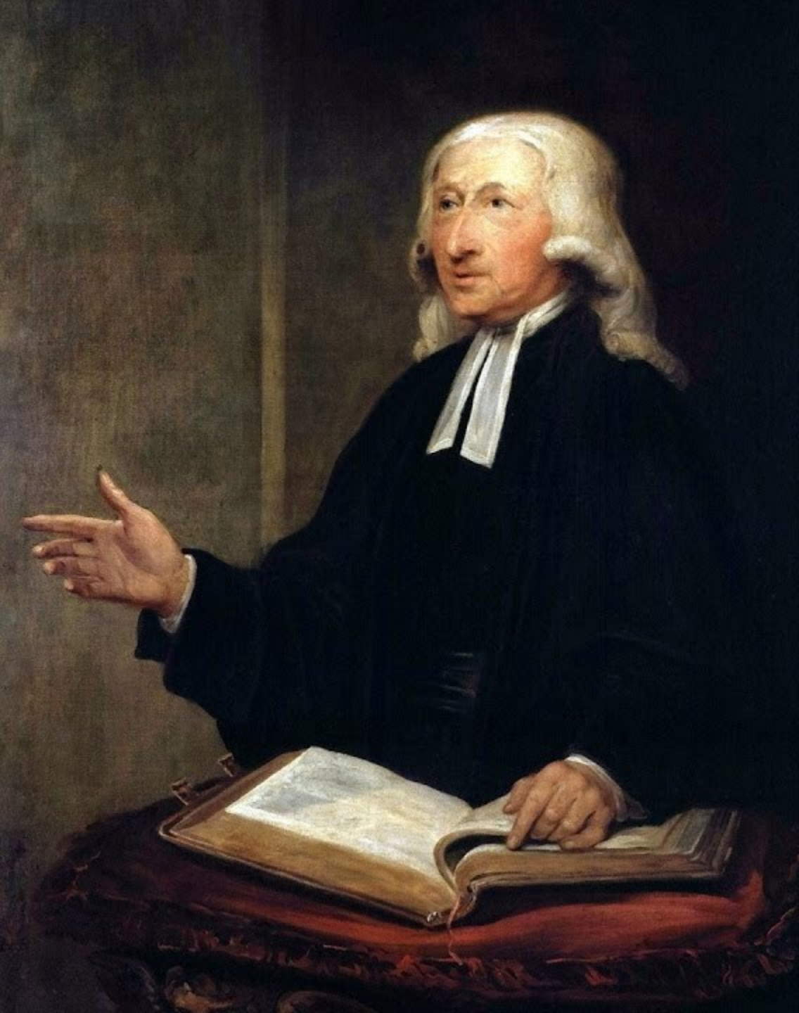
John Wesley 1703 - 1791