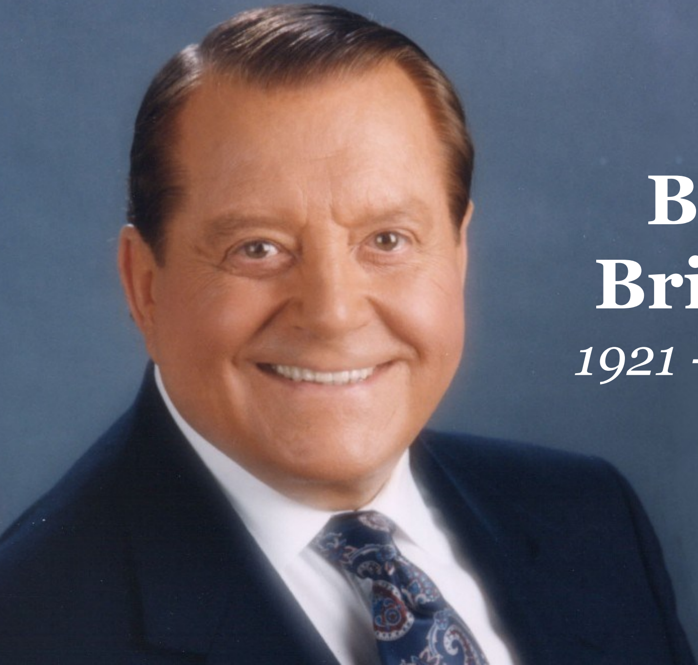
Bill Bright 1921 - 2003